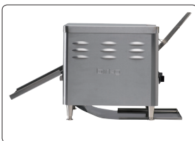
Toaster opening sizes : 260mm x 60mm